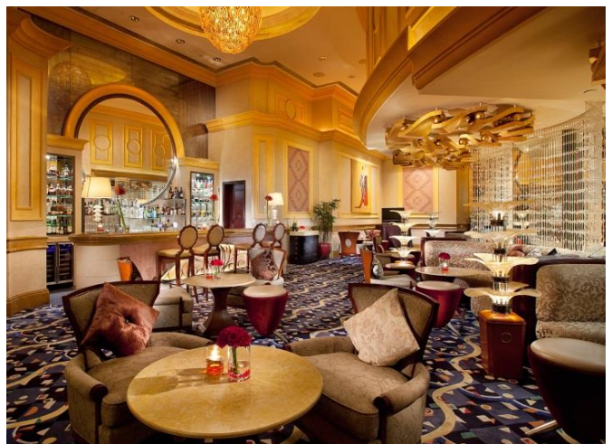
RendezVous – “Summer Berries Dream” Afternoon Tea Set, perfect for a summer getaway.