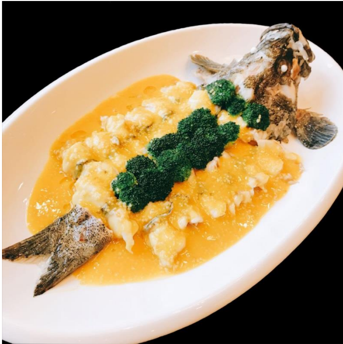
Le Chinois – White garoupa is sliced and steamed to tenderness in golden supreme soup, which is prepared with a variety of bones and chicken broth, together with mashed pumpkin: rich in collagen, golden in color.