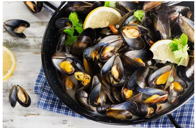
Mistral – Mussels & Clams Fiesta